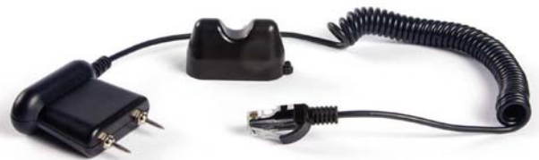
MR02 Pin Probe included

PORTLAND Corporate Headquarters FLIR Systems, Inc. 27700 SW Parkway Ave. Wilsonville, OR 97070 USA PH: +1 503.498.3547