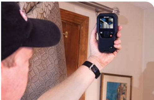
Scanning ceiling & wall joint for moisture issues